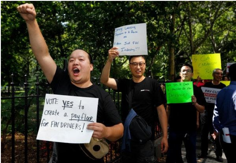
Victory for the New York Taxi Workers Alliance (See page 6)

Uber has become one of Silicon Valley’s biggest success stories and changed the way people across the globe get around. But it has faced increased scrutiny from government regulators and struggled to overcome its image as a company determined to grow at all costs with little regard for its impact on cities. See Page 6